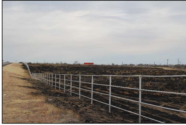
41 acre rangeland fuel reduction treatment bordering Stinnett, TX in Hutchinson County.