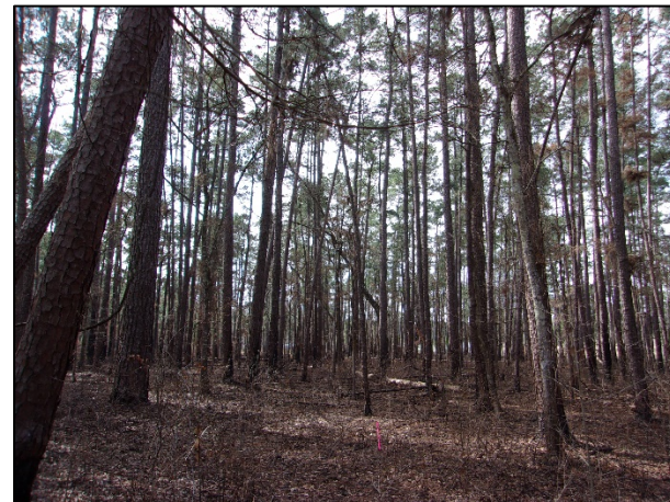
147 acre prescribed burn to maintain understory of loblolly pine stand in Montgomery County.