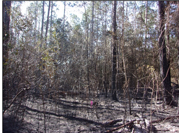
153 acre first entry prescribed burn in Hardin County.